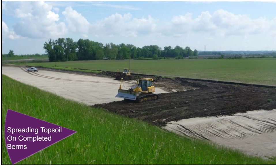
Spreading Topsoil On Completed Berms