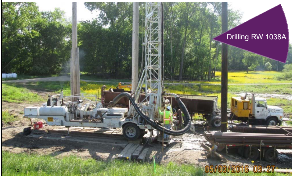
Drilling RW 1038A