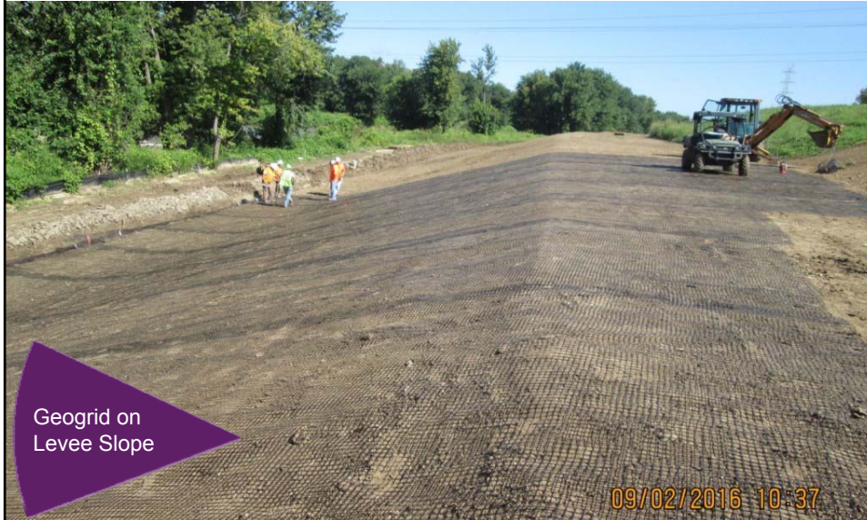
Geogrid on Levee Slope